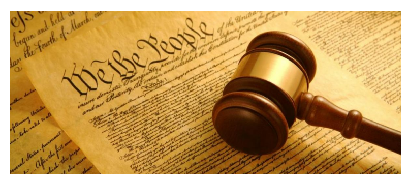
The right to a free public education

Fortunately, you have rights under federal law and New Jersey law that guarantee your children's access to a quality education in schools.