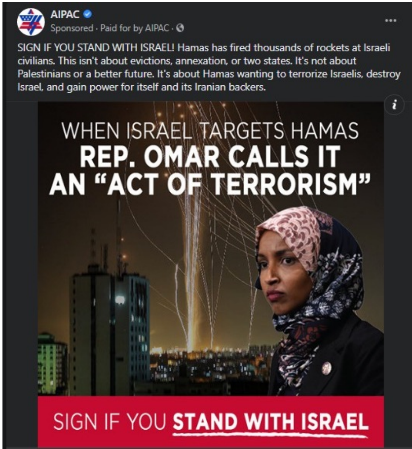
Figure 1 Twitter ad by AIPAC.

Thus, it is hardly surprising that in 2021 AIPAC published a political ad defaming Rep. Omar as a “terrorist” for asking Secretary of State Antony Blinken whether international law protecting civilians should apply to all governments and armed groups equally, including the United States and Israel. 173 When a broad spectrum of Jewish groups published an open letter calling on AIPAC to retract its statements, which generated renewed death threats against the congresswoman, who is a Somali refugee and the only Muslim in Congress to wear a hijab, AIPAC doubled down. 174 Even staunch congressional allies of AIPAC such as House Majority Leader Steny Hoyer and Speaker Nancy Pelosi criticized the lobbying group for its incendiary rhetoric. 175 Hoyer stated “I disagree with the statements made by the members, but attacking them in ads does not advance the goal of increasing support for Israel,” while Pelosi said, “I don’t agree with Congresswoman Omar’s comments, but it’s very disappointing to see deeply cynical and inflammatory ads twisting her words.” 176